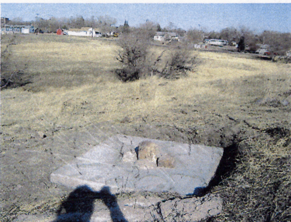
Figure 3 - looking east at ancient fence remnants.