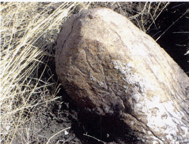
Figure 1 - as found leaning NE