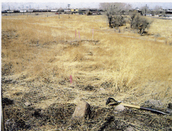
Figure 4 - Looking north at ancient fence post remnants.