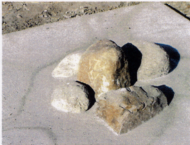
Figure 2 - rehabilitated with concrete pad.